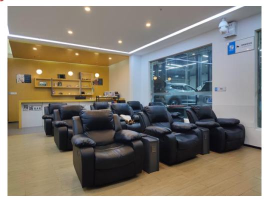
Customer rest area