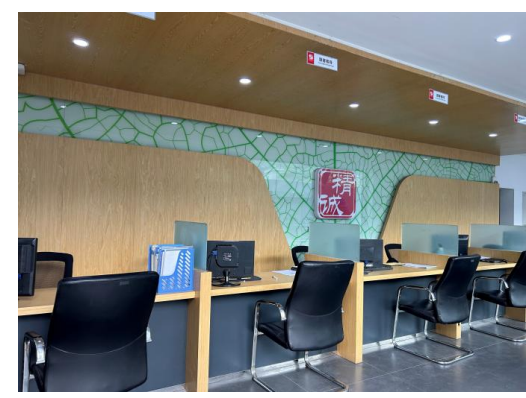
Customer reception area