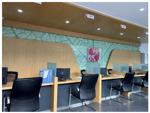
Customer reception area

Safety first, quality first, service first, and user first.Corporate spirit: leaving users' troubles and taking away the sincerity of the en.