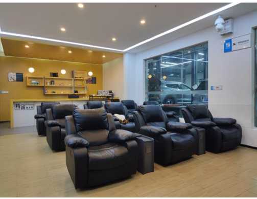
Customer rest area