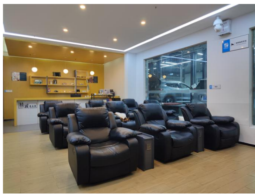
Customer rest area