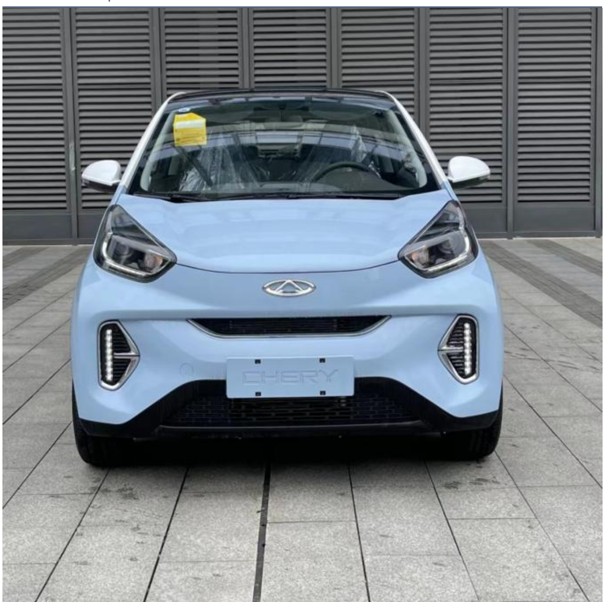
Packing & Delivery